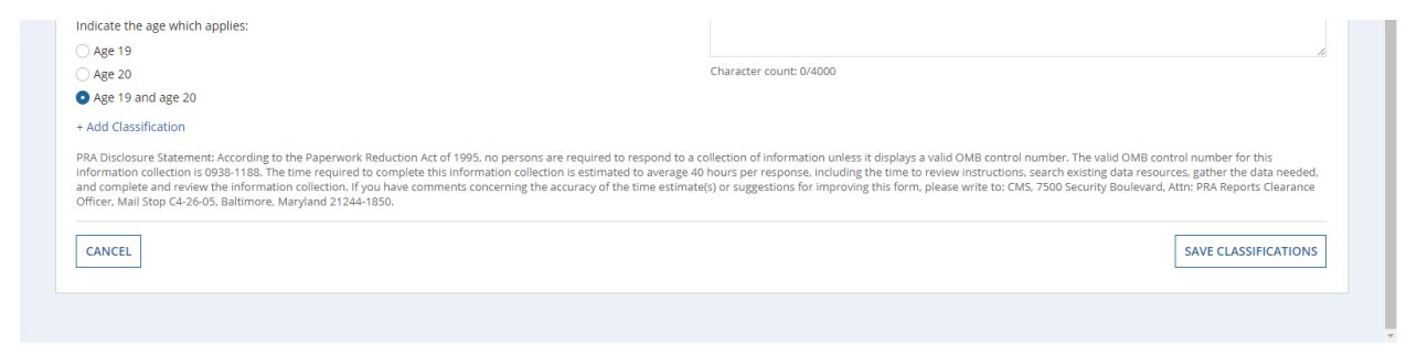
Figure 3: Reasonable Classification of Children - Limit- Screenshot 3