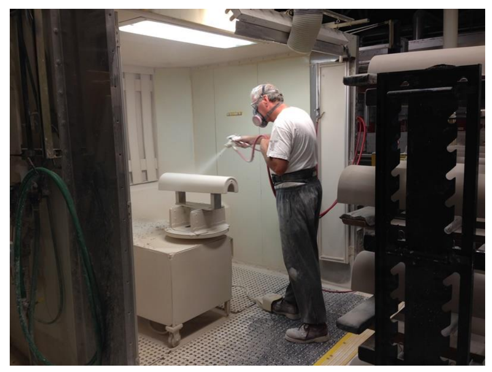
Cleaning Dry-Filter Glaze Spray Booths Where Glaze Overspray is Dried to the Booth Walls and Floors