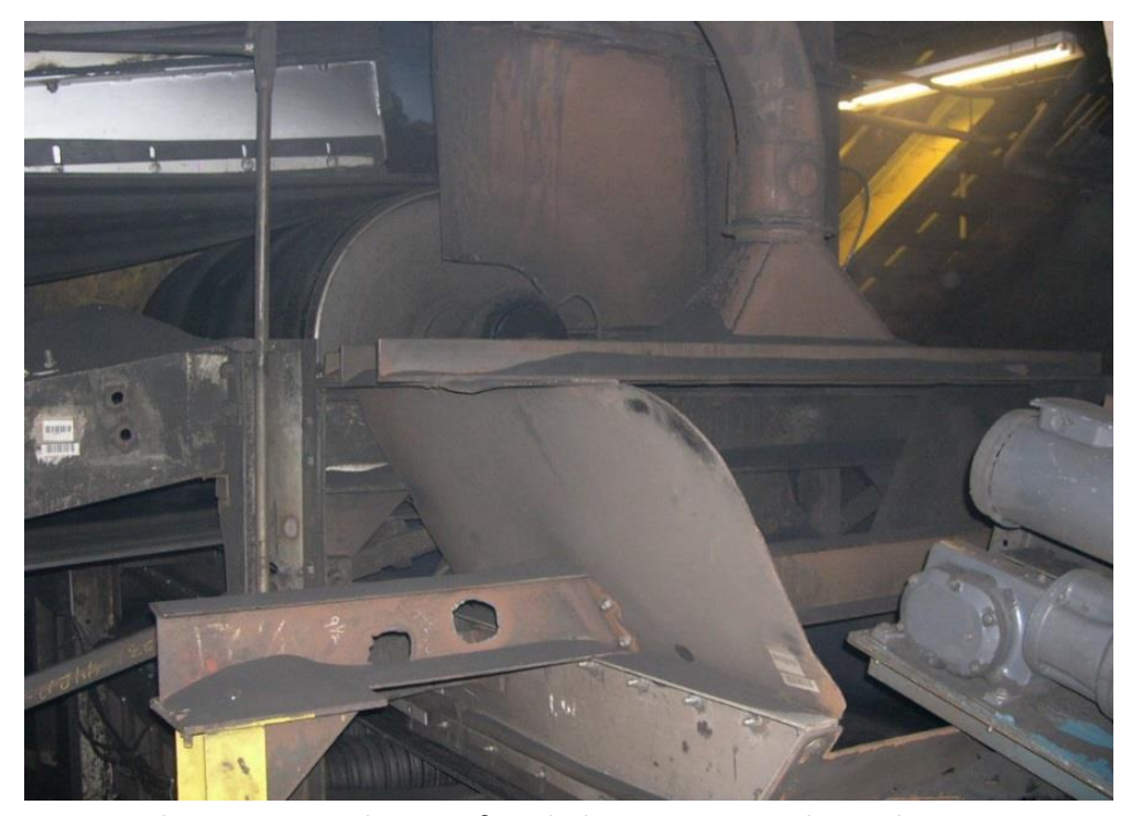
Cleaning Sand Out of Tightly-Compacted Machinery Where Access is Extremely Limited