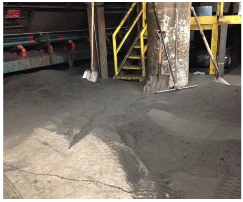
Cleaning Large Accumulations of Sand In and Around Sand Handling Systems