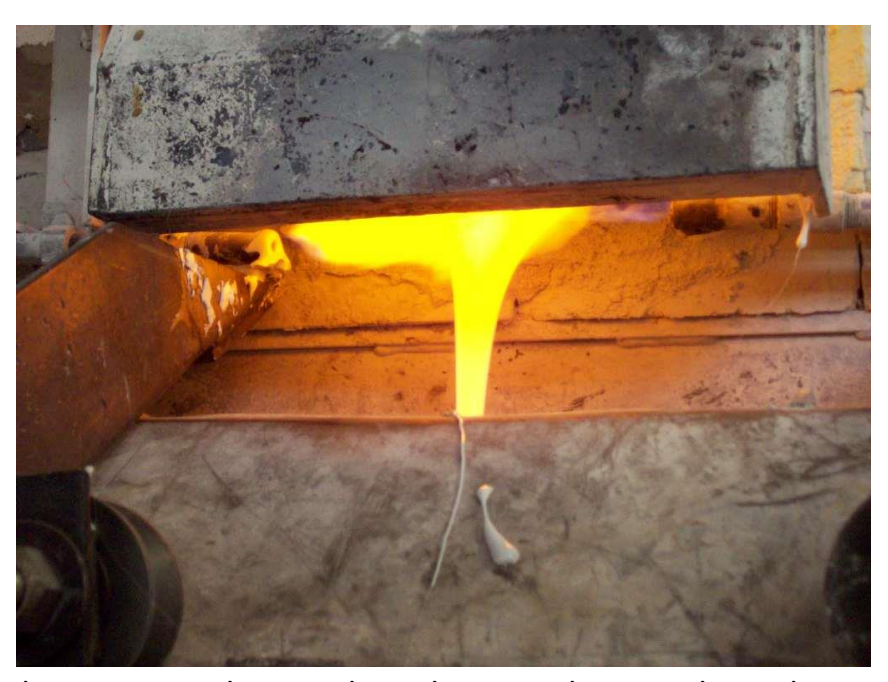
Cleaning In and Around Machinery Where Molten Glass or Molten Iron Are Present