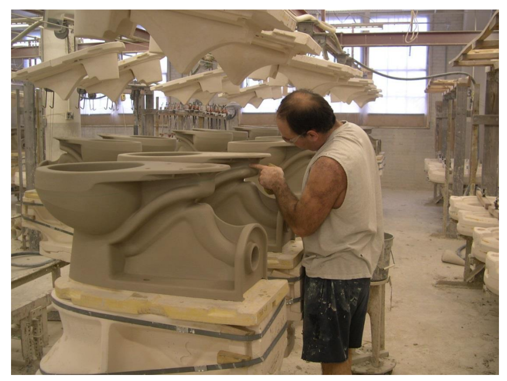
Cleaning Vitreous Cast Shop Floors Where Broken Pieces of Clay Accumulate and Spilled Slip is Dried to the Concrete Floor