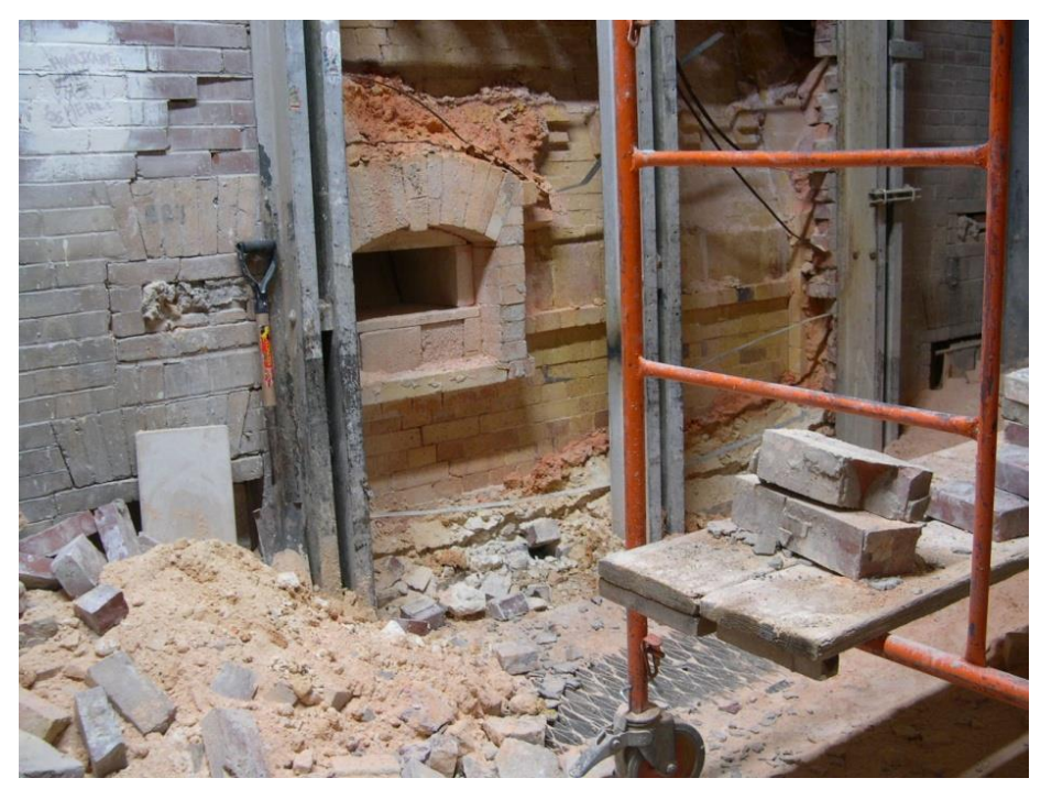
Cleaning Refractory Brick Renovation Areas where Debris of Varying Size is Generated