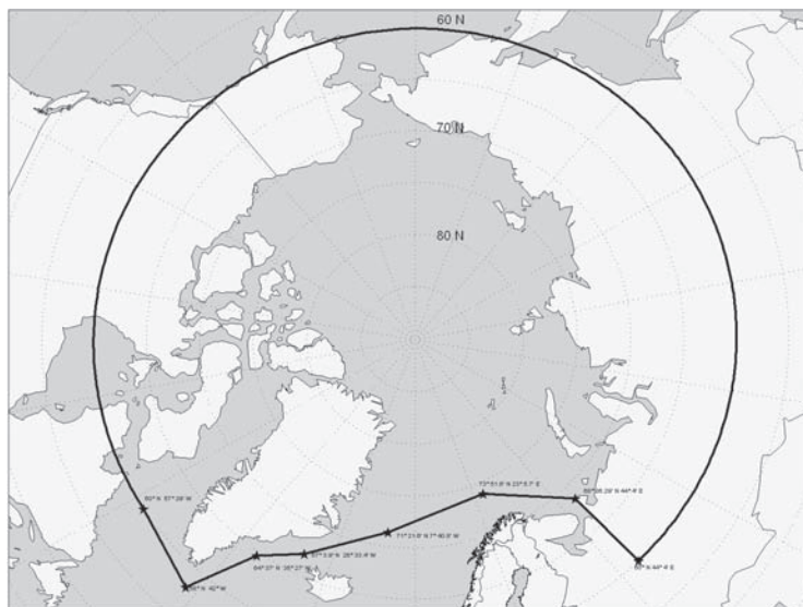
Figure 1 – Maximum extent of Arctic waters application (see paragraph G-3.3)*