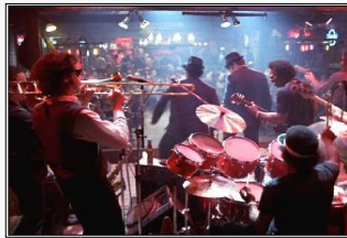
2) Sing Along