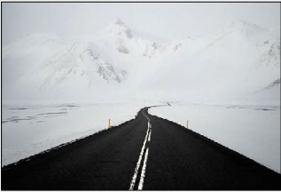
1) Cross The Line