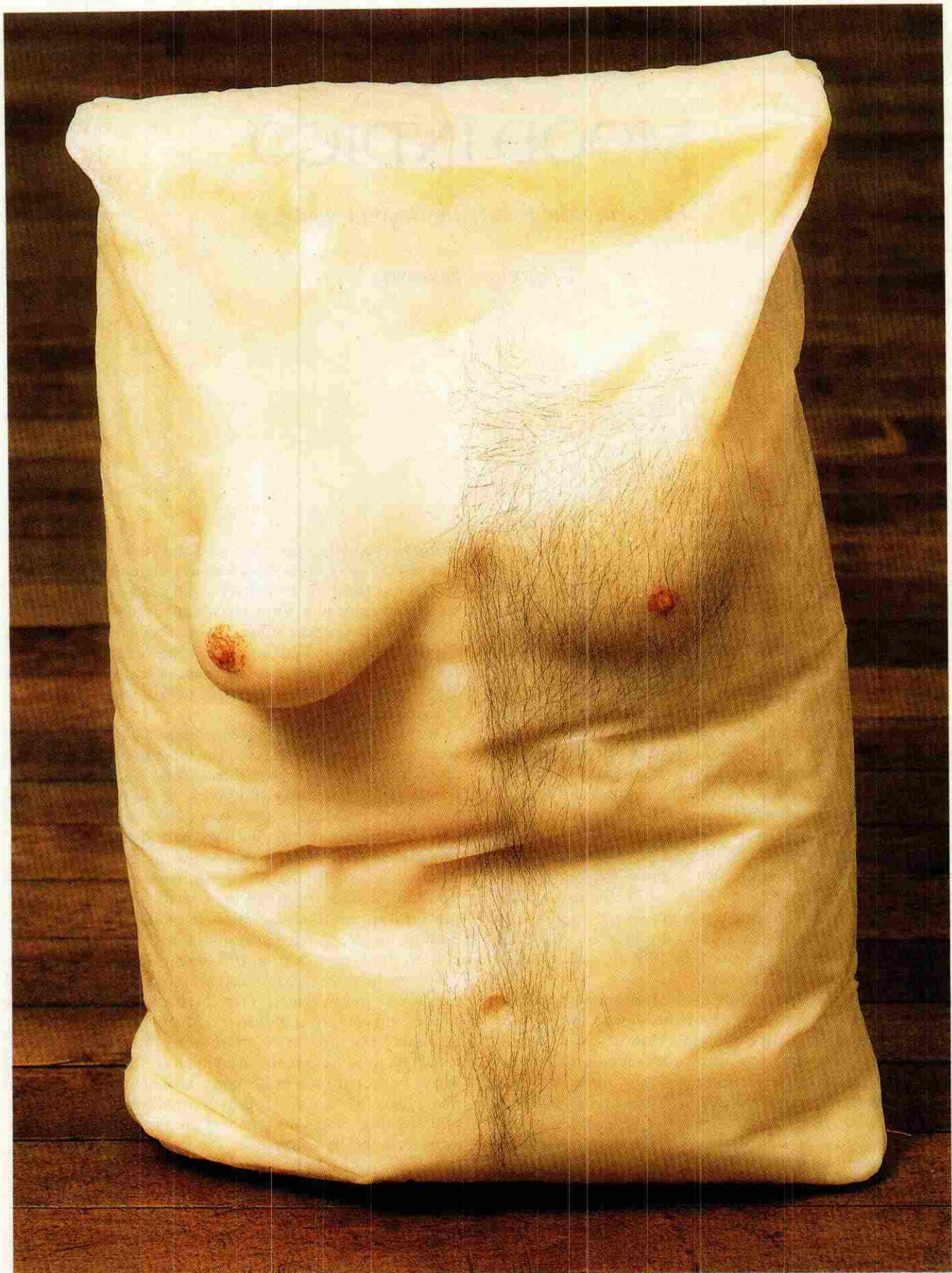
Robert Gober, Untitled , 1990