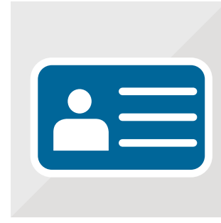
Permanent Resident Card