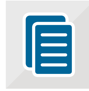
Spouse's citizenship documents

The other documents you need will depend on the information you enter in the form (such as your personal history, family, and circumstances).