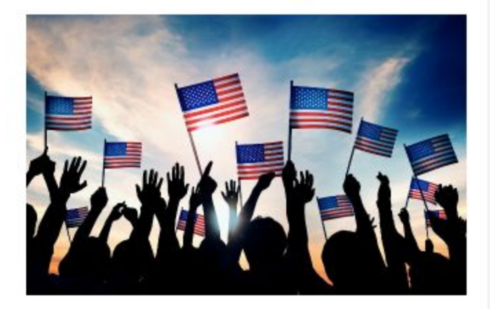
Advise USAGov on How to Serve You Better

You've been getting USAGov emails, and we want to make sure we're making these relevant for people like you. Please take two minutes to provide your input.