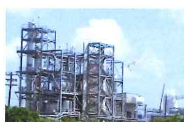
REG Houston Seabrook, TX 35 MGY