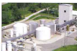
REG Danville Danville, IL 45 MGY