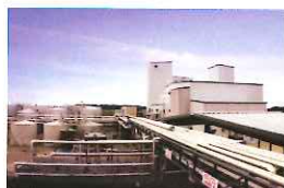
REG Albert Lea Albert Lea, MN 30 MGY

The REG network of state-of-the-art biorefining production facilities ensures we can deliver the highest-quality product where and when you need it.