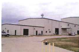
REG New Boston New Boston, TX 15 MGY