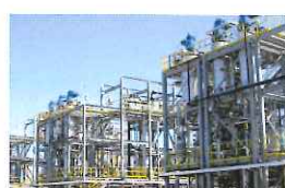
REG Seneca Seneca, IL 60 MGY