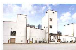
REG Mason City Mason City, IA 30 MGY