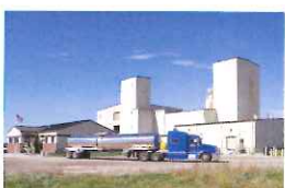
REG Newton Newton, IA 30 MGY