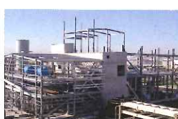
REG New Orleans St. Rose, LA 60 MGY

You can feel confident about making an investment in biofuels with REG as your partner.