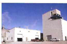
REG Ralston Ralston, IA 12 MGY