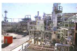
REG Geismar Geismar, LA 75 MGY