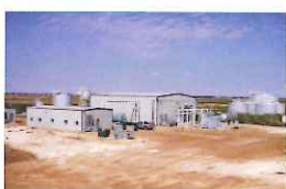
REG Clovis Clovis, NM 15 MGY