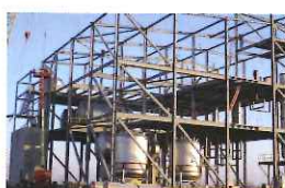
REG Emporia Emporia, KS 60 MGY