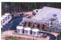
REG Atlanta Ellenwood, GA 15 MGY

REG is positioned to meet the rising demand for biofuels and continues to look for opportunities to increase production and distribution capacity.