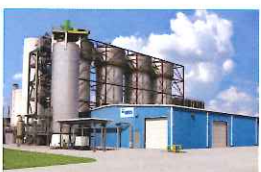
REG Okeechobee Okeechobee, FL Research Facility