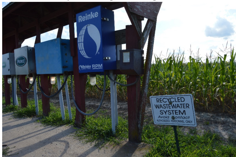
The wastewater pumping system outside at the Mountaire slaughterhouse in Millsboro, Delaware, next to the corn fields, where the waste is sprayed

“These guys are just finding new ways to dump stuff,” said Nidel. “Spray fields are like spreading your garbage in your backyard. It’s not a magic solution. They do not reduce the amount of waste, or change where it is eventually going to go. It’s all going into the environment, one way or the other.”