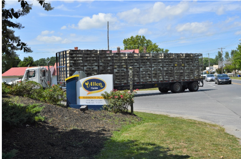
A truck loaded with live chickens drives through the entrance of the Allen Harim slaughterhouse in Harbeson, Del. The plant had more than 90 water pollution violations over four years, including dumping illegal amounts of ammonia and fecal bacteria into a local creek.

This report examines the history of the meat processing industry in the U.S., the sources and impacts of its water pollution, and recommended solutions. We use three local examples in different parts of the U.S. to illustrate different aspects of the industry that make water pollution from slaughterhouses a complex environmental challenge to tackle.