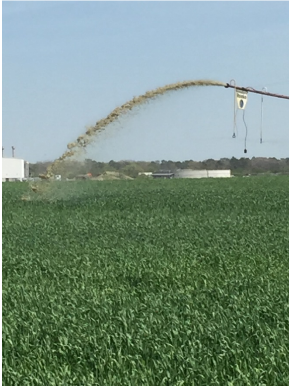
Waste being sprayed by the Mountaire slaughterhouse onto corn fields near people's homes in Millsboro, Delaware, where it has contaminated at least 20 home drinking water wells.

“The smell is so bad, we can’t even go outside our homes to barbecue or anything like that,” said a resident of Herbert Road in Millsboro who asked not to be named because of the ongoing legal action with the Mountaire plant. “We have to just keep our windows closed and our air conditioner on. We can’t drink the water. And it’s impacting our health, too,” he said, holding a package of medication he just picked up from the drug store to treat his chronic stomach and intestinal problems.