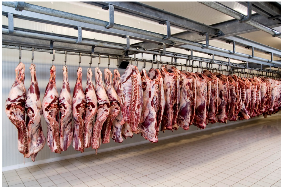
Many large meat processing plants in the U.S. today are owned by international companies based in Brazil, China, Arkansas, and elsewhere, making control and management decisions more remote from the pollution impact in rural American communities

2014. And a paddle in a liver giblet chilling vat ripped the leg of a 17-year-old immigrant worker from Guatemala at a Case Farms poultry plant in Canton, Ohio, in 2015. 12 Thirty-four percent of U.S. slaughterhouse employees were Hispanic or Latino in 2017, and the average hourly wage was $13.46. 13