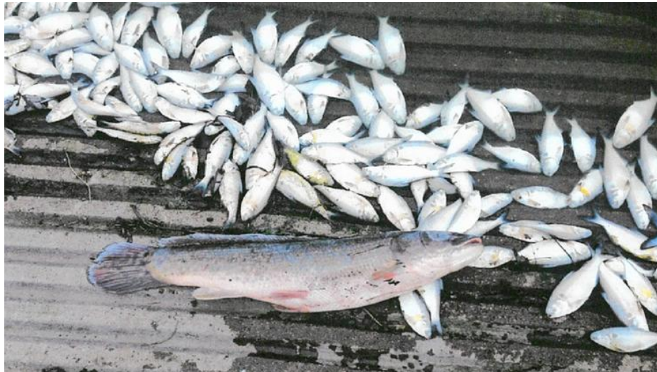
A spill of 29 million gallons of hog waste from a JBS meat processing plant in Beardstown, Illinois, killed 64,566 fish in tributaries to the Illinois River in 2015.

Beardstown is a small, rural community of only 6,000 people, and many of the 2,000 workers in the plant are immigrants, many from Mexico and about 30 other countries in Latin America, Africa and elsewhere. “Lower wages, along with increases in work speed and injuries – a trend in meatpacking plants across the Midwest in the late 1980s – made jobs less attractive for most white skilled workers,” according to a Reuters news report on the plant. 33 “Latino immigrants started coming to Beardstown, once an all-white town