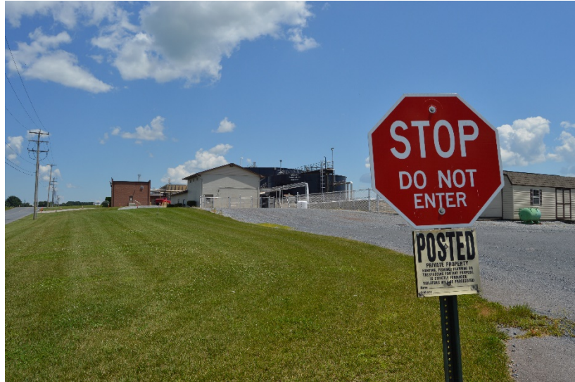
The Keystone Protein Company meat processing plant in Fredericksburg, Pennsylvania, violated its water discharge permit 62 times between January 1, 2016, and June 30, 2018, discharging excessive amounts of nitrogen pollution into a tributary to the Susquehanna River and Chesapeake Bay.

Simpsonville, KY, Keystone Protein Co. in Fredericksburg, PA, Tyson Poultry in Sedalia, MO, and Cargill Meats Solutions, Inc. in Schuyler, NE. Keystone Protein, specifically, has failed to meet its monthly nitrogen limits every month since the beginning of 2016, discharging as much as three times what their permit allows.