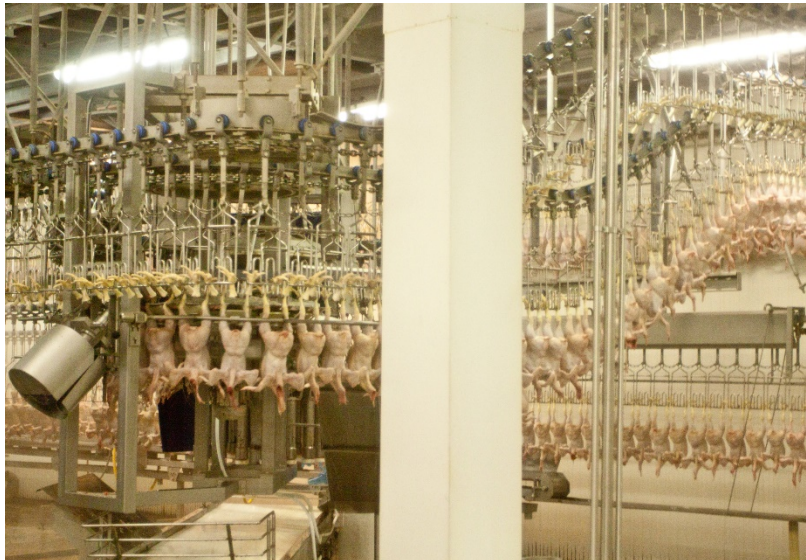
High-speed poultry slaughterhouse conveyor belts have vastly increased production—but can also injure workers.

Things started to change after World War II. With modern refrigeration and changes to how meat was packaged and sold, slaughterhouses no longer had to be close to