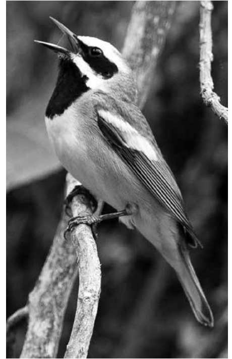
Golden-winged Warbler by David Cree

This project is part of the new Regional Conservation Partnership Program of the U.S. Department of Agriculture that includes 100 projects in all 50 states. The program will provide more than $370 million for targeted conservation efforts through NRCS.