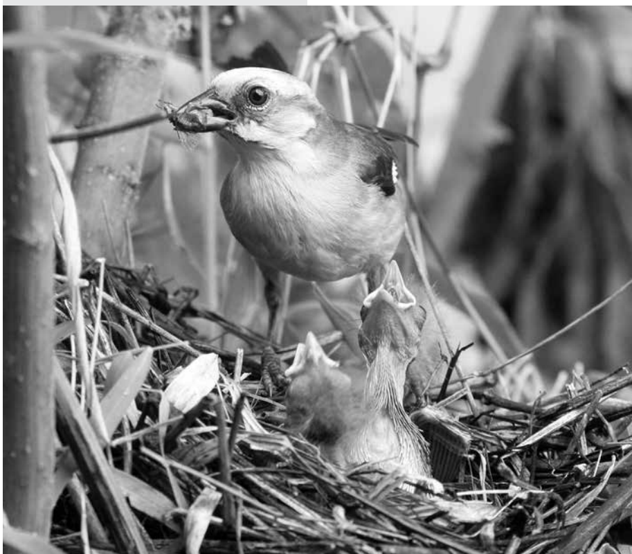
Pale-headed Brush-Finch at nest by A. Sornoza