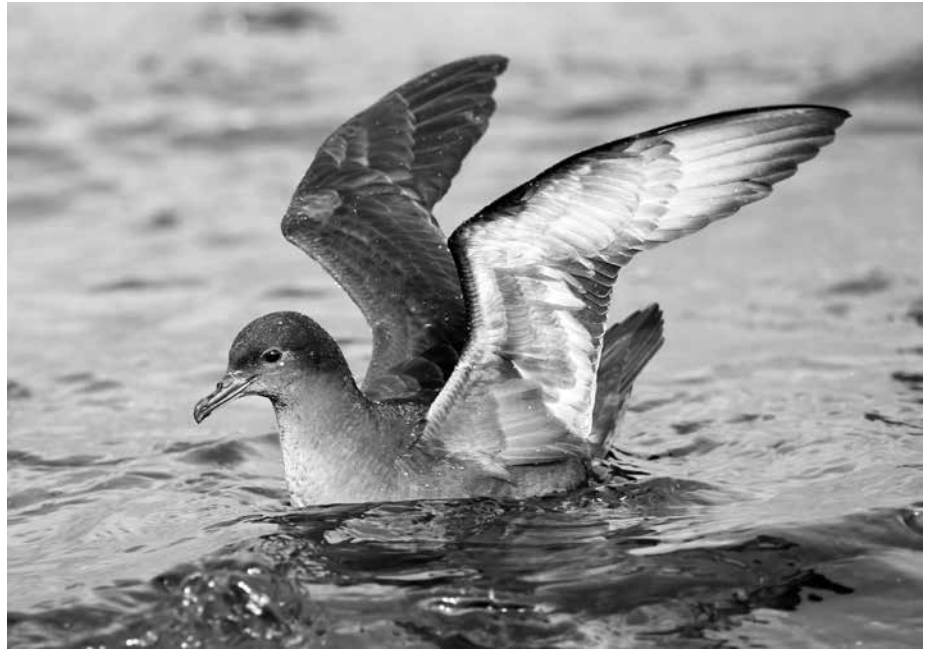
Short-tailed Shearwater

Of 8,871 fledglings found, 39 percent were dead or dying. Mortality increased through the fledging period, in mornings, and with increased traffic during holidays. Higher numbers of grounded fledglings are expected during adverse weather conditions, but this study found for the first time that wind is also a factor, showing that nights with the highest speed winds resulted in the largest numbers of grounded birds. The report suggests that because shearwaters need a long runway to take off, wind becomes even more critical for fledglings that are not experienced flyers.