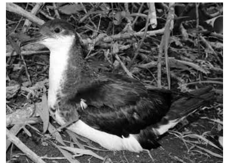
The state-of-the-art fence (top) at Kilauea Point National Wildlife Refuge will help protect native species such as the Hawaiian Petrel (lower left) and Newell's Shearwater (lower right).

"One of those species that may particularly benefit is the Newell's Shearwater, which is threatened by non-native predators...Creation of a colony protected from predators will be a major step forward in recovering the species."