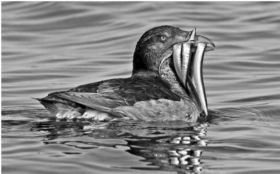
Rhinoceros Auklet

Read more at: www.sciencemag.org/content/334/6063/1703