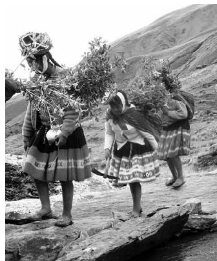
Planting Polylepis in Peru by ECOAN

These Polylepis forests protect a community of endemic and threatened birds, including the Royal Cinclodes, Ash-breasted Tit-Tyrant,