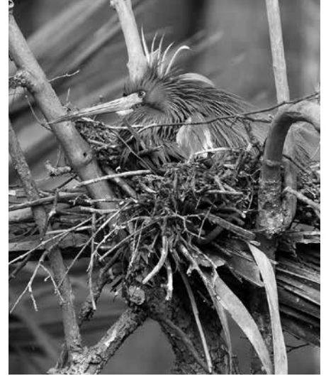
Tricolored Heron

"An environmentally healthy Everglades region is vitally important to many thousands of wading birds. Clearly, the significant declines in nesting of many of the typical species of the region tells