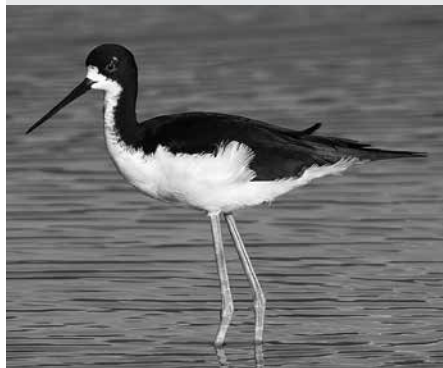
Hawaiian Black-necked Stilt

...a recent news report revealed that more than 1,000 feral cats run at-large around Kanaha Pond Wildlife Sanctuary and in Kanaha Beach Park on Maui. The proximity of such a large population of cats next to federally endangered birds...is a conservation disaster.