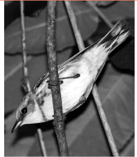
Cerulean Warbler

"This project will create a tremendous opportunity for our partnership to engage private landowners and promote contiguous areas of viable working