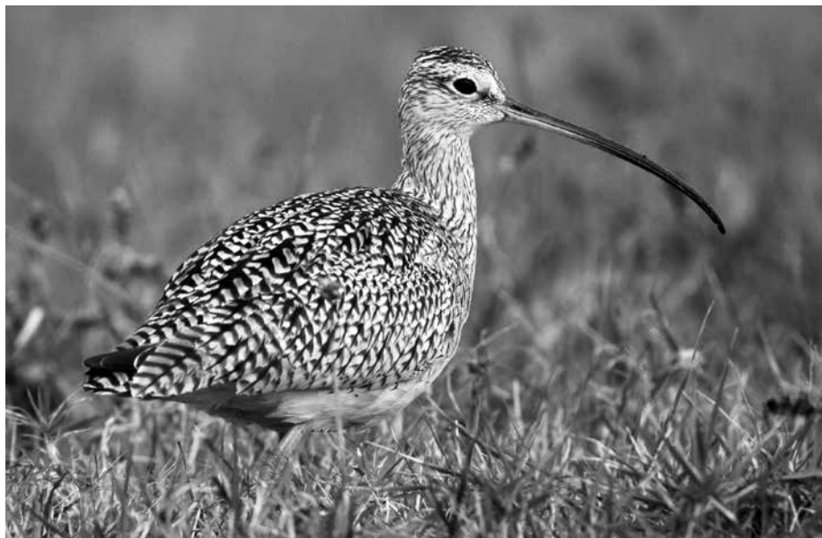
Long-billed Curlew

Some of the initial properties will serve as pilot efforts that the partners hope will encourage more landowners to participate.