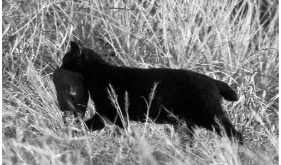
Feral cat with Hawaiian Coot.

Hawai'i's geographic isolation allowed for an amazing degree of speciation that could have inspired Darwin. Today, introduced species pose grave risks to these unique birds, and could be the final straw that pushes some into extinction.