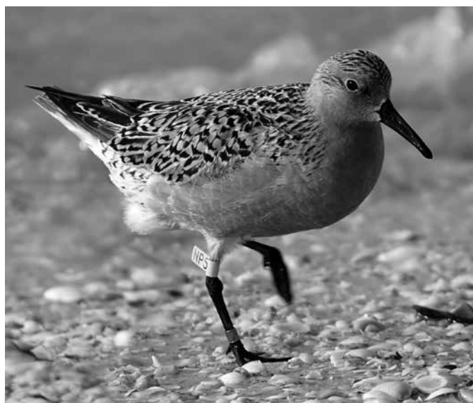
Red Knot