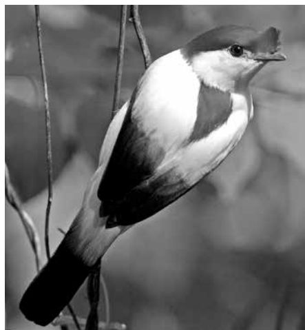
Araripe Manakin by Ciro Albano

"The Oasis Araripe Reserve will also serve as an important focal point for local education, where visitors can learn about the importance of the bird and see ongoing conservation efforts, such as the Aquasis reforestation project," commented Bennett Hennessey, who heads ABC's Brazil Conservation Program. ABC is actively supporting the reforestation of the newly established reserve, with plans to plant 5,000 saplings of 15 native tree species in 2015.