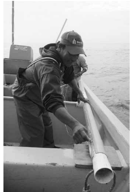
Fisherman using new NISURI line setting technology to reduce bird interaction at the port of Santa Rosa, Ecuador.