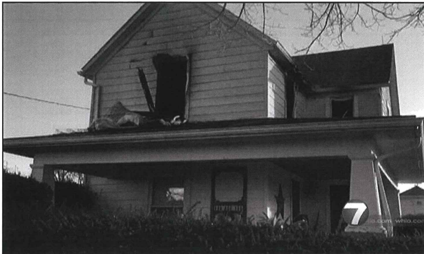
Electronic cigarette the cause of fire in Miami County

UPDATE @ 12:40 a.m.: Firefighters said a faulty battery in an e-cigarette started a fire that damaged a Tipp City home Friday night.