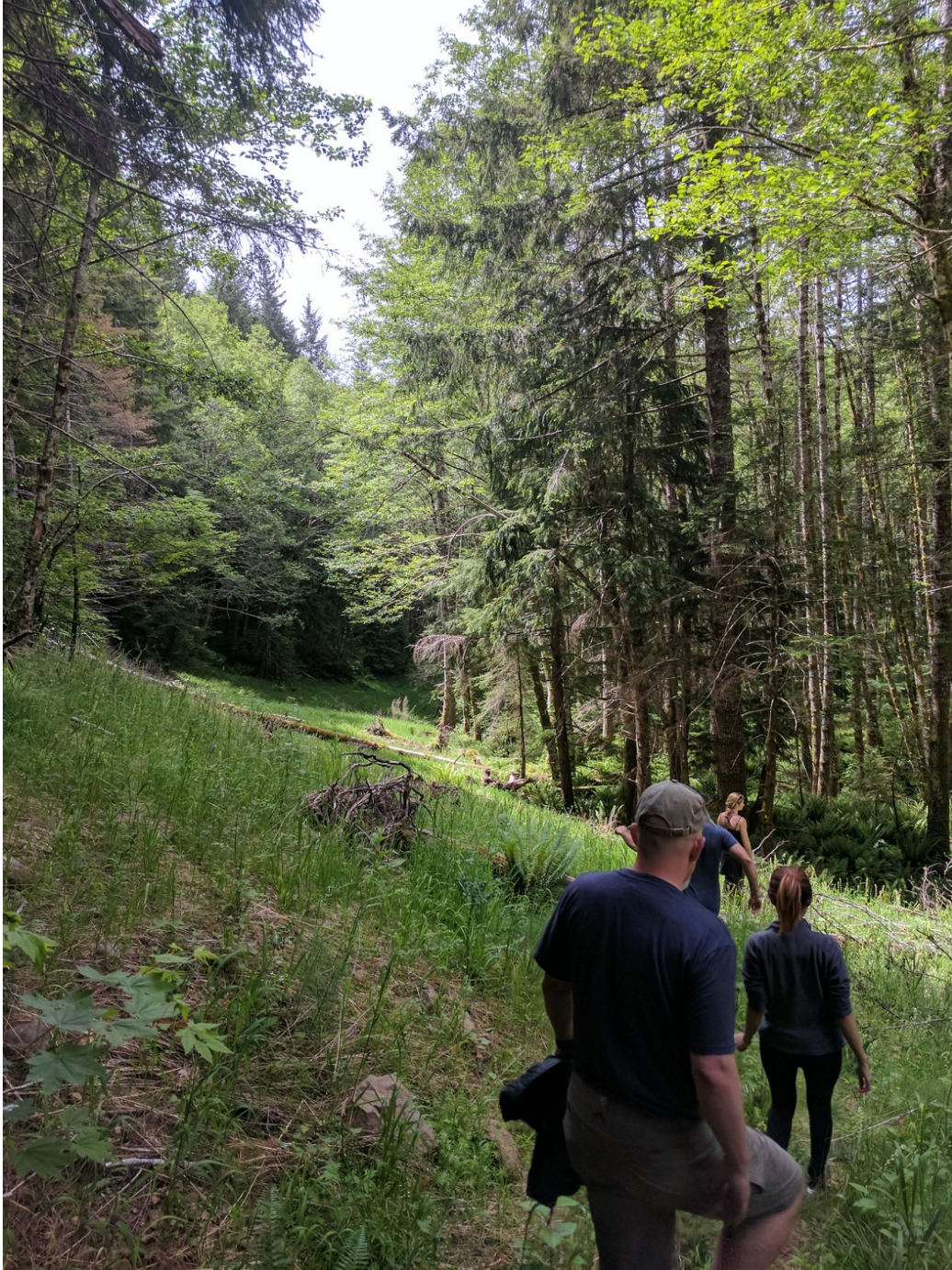
Recontoured road, Olympic National Forest - Skokomish Watershed, 2017.

maximize restoring ecological integrity to the area. These actions will ensure the Forest Service finally achieves its goal to establish a truly sustainable forest road system.