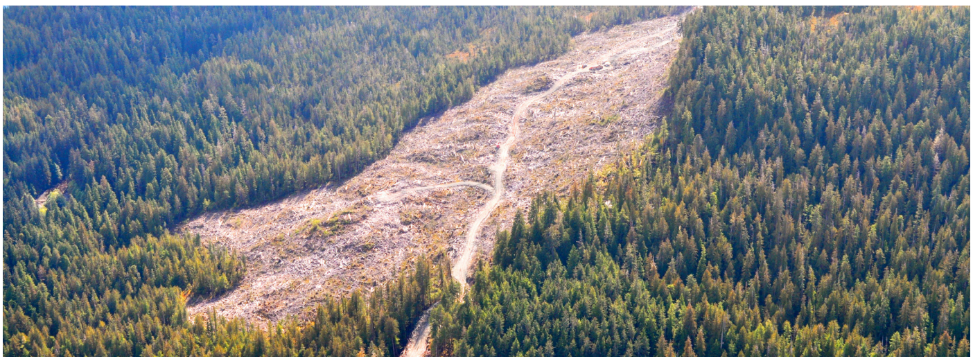
Used with permission.

The U.S. Forest Service (USFS) within the Department of Agriculture manages 193 million acres of public forests and grasslands collectively known as the National Forest System. The Tongass National Forest (Tongass) in southeast Alaska is the largest national forest at 16.8 million acres, roughly the size of West Virginia. Every year, the USFS prepares and conducts sales for the rights to harvest millions of board feet of timber from the Tongass. These sales have consistently generated less revenue than the USFS spends to administer them, resulting in large net losses for U.S. taxpayers. New budget data for the latest fiscal year reveals that the USFS has continued its decades-long streak of losing millions of dollars on Tongass timber sales.